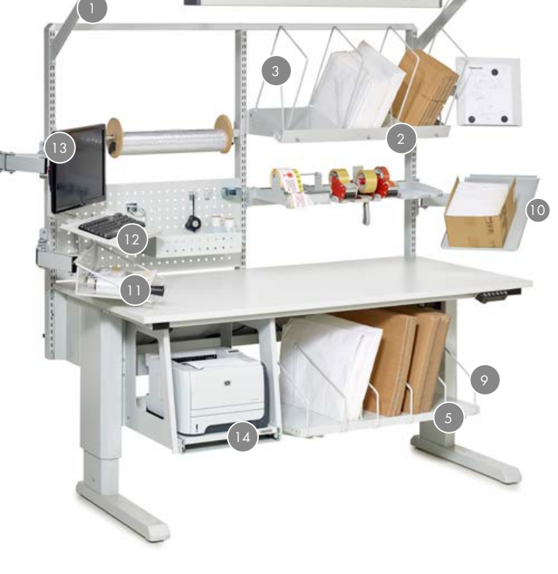
Fastening parts for SPM-shelf